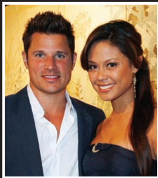
Nick Lachey & Vanessa Minnillo