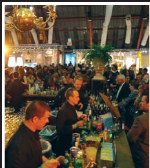
Preview gala benefiting P.S. ARTS