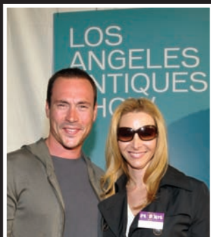
Chris Klein & Lisa Kudrow