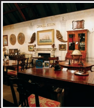
Daniel Stein Antiques, San Francisco