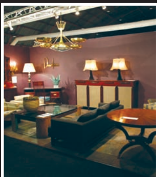
Downtown, Los Angeles